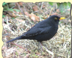
Blackbird Londubh A member of the thrush family, one of our finest songsters. Adult males have black plumage with a yellow bill and ring around each eye. Females are browner and duller overall.