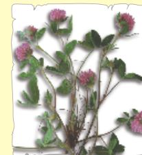
Red Clover Seamair rua