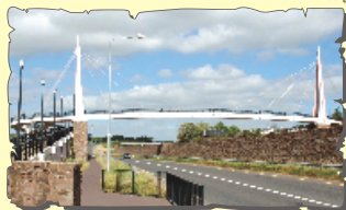
Hermitage Bridge In 1993 this bridge was built by the National Roads Authority to provide safe pedestrian access over the newly completed N8.