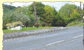
From Kearney's Cross , the chimney stack of the 19th century Knocknahorgan Silversprings Starch Works can be seen when trees are bare in winter. An underground brick tunnel leads uphill to the stone-built chimney which is c. 12m high.