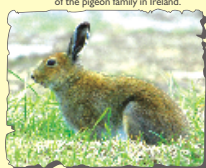
Hare Gloria This species is also known as the Arctic Hare. The reddish brown race found in Ireland is unique to this island and may in fact be a separate species.