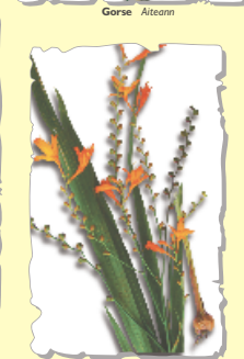
Crocus Felleastram dearg