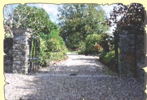
The Hermitage Once the property of Captain Glen Browne. The remains of the hermits' cells can still be seen in the nearby woods.

THIS LOOP TAKES ITS NAME FROM THE AREA ALONG THE WALK WHERE, IN EARLY CHRISTIAN TIMES, HERMITS LIVED IN STONE CELLS. ON THIS LOOP YOU WILL ENJOY BIRD WATCHING AND A WONDERFUL SELECTION OF FLORA AND FAUNA.