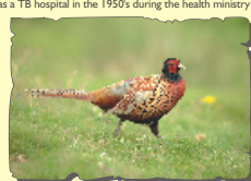
Pheasant Piasan Originally introduced from eastern Asia as a quarry for hunters, this species is now well established.