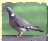
Woodpigeon Glin coile A common year-round resident, this is the largest member of the pigeon family in Ireland.