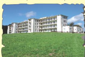
Sarsfield Court Visible to the north-west is St Stephens Hospital, Sarsfield's Court, built as a TB hospital in the 1950s during the health ministry of Dr Noel Browne.