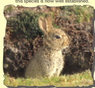
Rabbit Coinin Introduced to Ireland from Europe many centuries ago, it is now one of our most familiar and easily seen mammals.