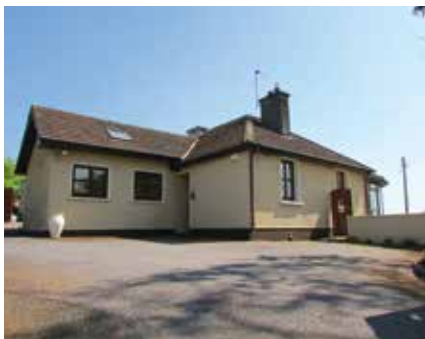
Ballincroig, Dublin Pike €325,000

We value what matters to you, we find you a home not just a house