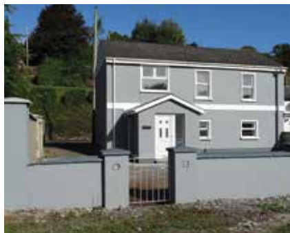
Lynwood, Kilcoolishal €250,000

This three bedroom two storey semi-detached property has been totally refurbished and finished to a good standard, ideally located on the Glanmire /Glounthaune "town land border" with the back of the property facing onto Factory Hill.