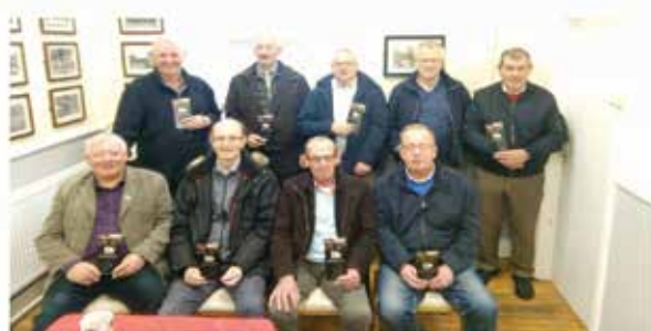
GLANMIRE Men's shed. Group photo of some of the men who attended the Shed's first informal chat on Monday 16th April. For the Month of April / May the shed shall meet at the Old Schoolhouse, Riverstown, Glanmire (opposite the Riverstown Inn) each Monday at 10:30am. ALL MEN ARE WELCOME – the shed is a space where "men can chat shoulder to shoulder" learning new skills, while working on projects / past-times, enjoying a cuppa.