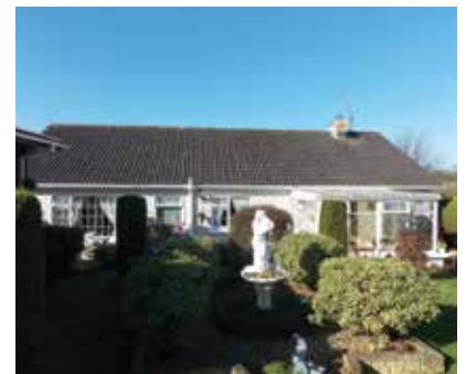
"Ellen" Killydonoghue, Glanmire €295,000

Impressive four bed detached bungalow residence set on c.1/2 acre mature site with attractive established gardens. The property has been very well maintained over the years and is tastefully decorated with emphasis on luxurious, opulent styling.