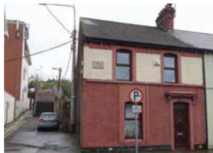
1 Arthur Villas, Watercourse Road, Blackpool €165,000

Extended three bedroom end of terrace property which was constructed in early 1900's, feature high ceilings, enclosed walled in east facing private back yard, ideal starter home or investment property.