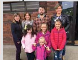
Glanmire Parents and children at the community games Art and handwriting event.