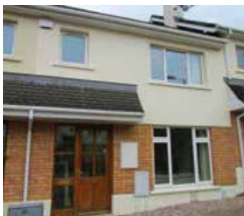
3 The Orchard, Woodville, Dunkettle €245,000

DNG Murphy Condon are proud to present this 3 bedroom townhouse property to the market for sale by private treaty. This house comes for sale in excellent condition, in a safe and secure cul-de-sac location.