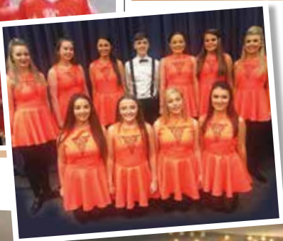
Wishing all at Rhythmic Feet and The Mary McCarthy School of Dance the very best of luck for their Annual Show on Wednesday, 9 May 2018, 8.00pm @ The Cork Opera House