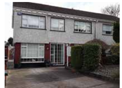
7 Springmount Road, Glanmire €285,000

A unique opportunity to acquire a generously proportioned family home in the heart of Glanmire. Mature established south facing rear gardens feature strongly.