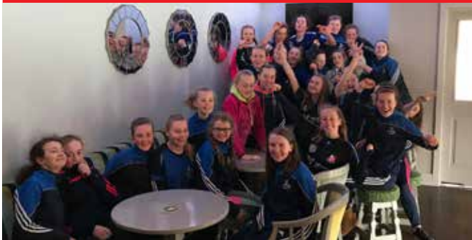
Sars Camoige U14A Feile Champions Celebrations