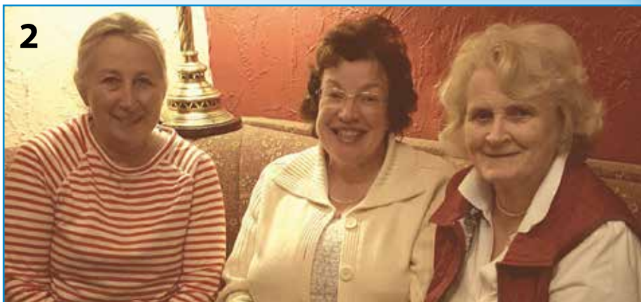
1. April competition: A bunch of spring flowers