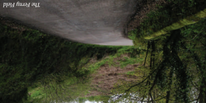
The Ferny Field

Research by The Heritage Society of Glanmire Area Community Association with acknowledgement to many local people for their contributions. See other walks presented by The Heritage Society of Glanmire Area Community Association: THE GLASHABOY WALK (2002) THE SALLYBROOK WALK (2003)