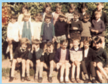
PHOTO: Shows the pupils on the day the school closed.